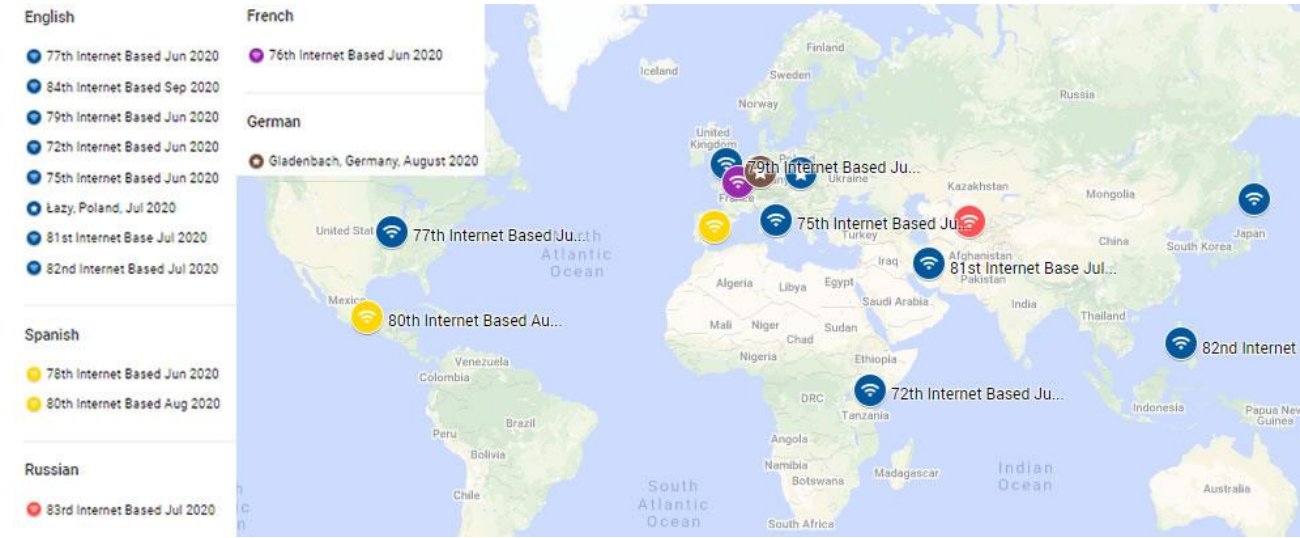
Map 1 - Seminars reported for the 3rd FIDE Council 2020